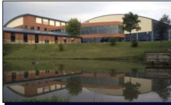
Student REC Center