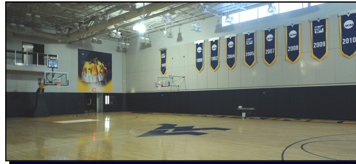
Basketball Practice Facility

WVU Women's Basketball Camps are open to any and all entrants (within the age & gender restrictions for each camp), regardless of skill level. For more information on any of our camps, please contact: